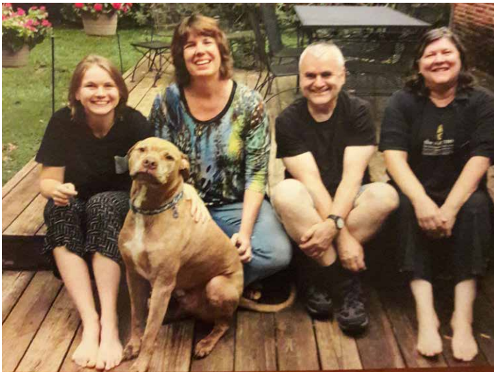
in Athens 2018