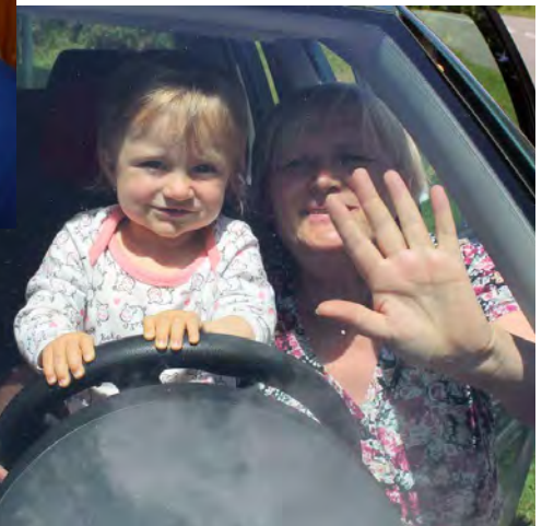
That’s how I drove to my English camp in 2017