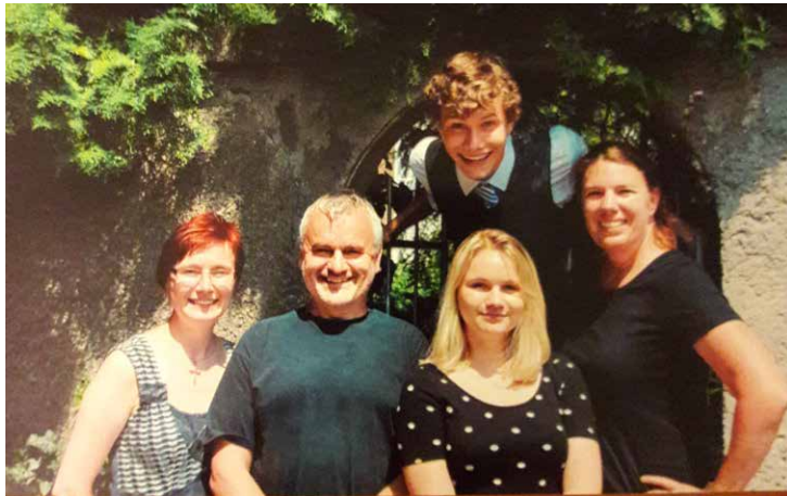
in Olomouc 2015