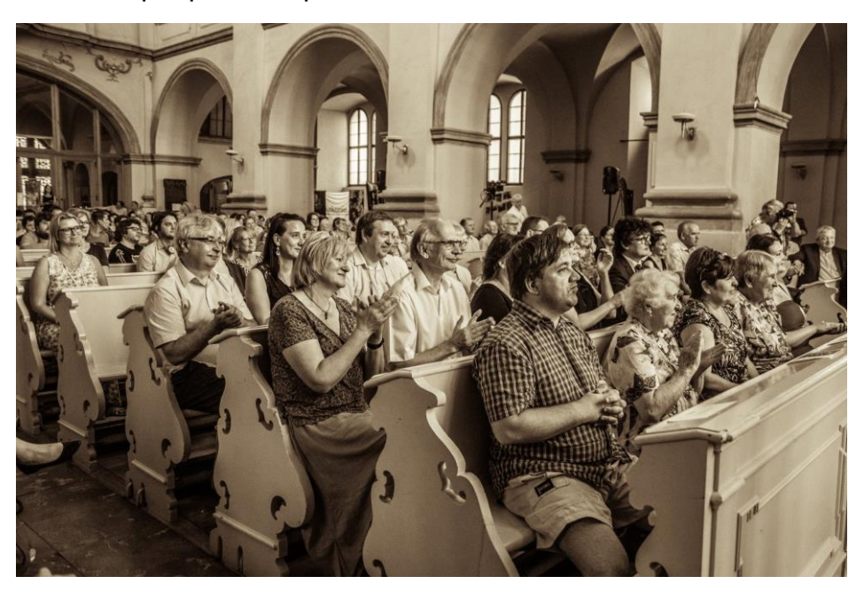
Founding Fathers and the Mother of Diaconia were given the Word.

This is how our thirtieth year was celebrated - We sang, clapped, listened and laughed! Over 260 people were present at Salvator Church.