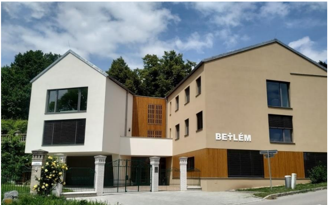
New Bethlehem home