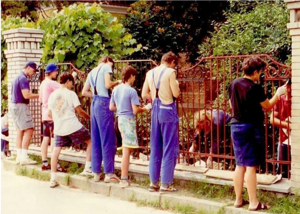
Painting the iron fence at Klobouky, 1992, beginning of PCUSA-ECCB partnership

It is good to go back to the beginnings. I think that for our partnership a very tangible beginning dates back to 1992 when a group from the PC USA and a group from the ECCB came together to Klobouky near Brno. They stayed at the manor of Klobouky working together on a project of Diaconia, the outreach of the ECCB, hoping to turn the old house, in some time, into a home for the disabled. The inter-generation Czech/American group worked side by side for nine days there.